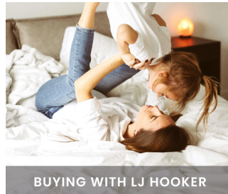
BUYING WITH LJ HOOKER