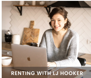
RENTING WITH LJ HOOKER