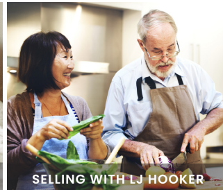
SELLING WITH LJ HOOKER